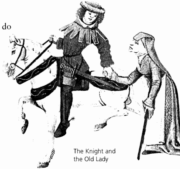
The Knight and the Old Lady

181 alack the day: an exclamation of sorrow, roughly equivalent to “Woe is me!”