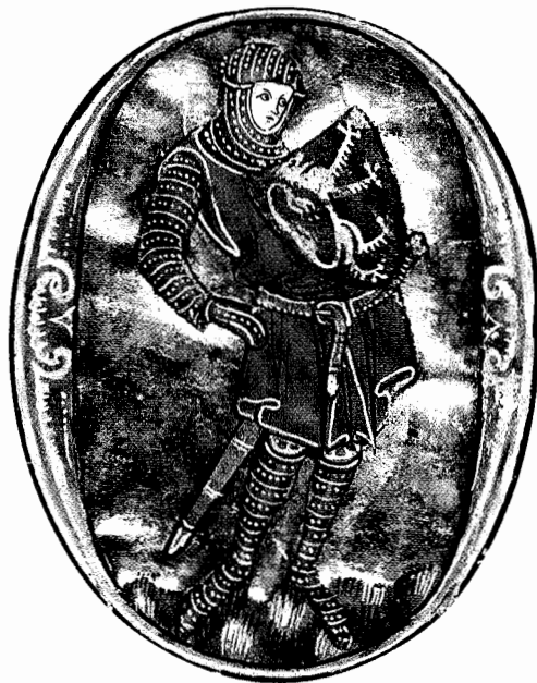
Sir Gawain, from an illuminated manuscript

165 As he rode home in a dejected mood Suddenly, at the margin of a wood, He saw a dance upon the leafy floor Of four and twenty ladies, nay, and more. Eagerly he approached, in hope to learn 170 Some words of wisdom ere he should return; But lo! Before he came to where they were, Dancers and dance all vanished into air! There wasn’t a living creature to be seen Save one old woman crouched upon the green. 175 A fouler-looking creature I suppose Could scarcely be imagined. She arose And said, “Sir knight, there’s no way on from here. Tell me what you are looking for, my dear, For peradventure that were best for you; 180 We old, old women know a thing or two.”