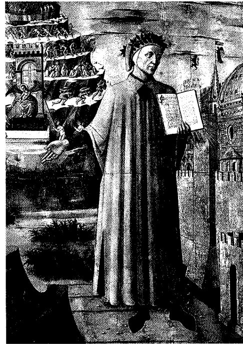
Dante and his Poem, Domenico di Michelino

"I could set right what you suppose a blunder, That's if I cared to, in a day or two, If I were shown more courtesy by you. 285 Just now," she said, "you spoke of gentle birth, Such as descends from ancient wealth and worth. If that's the claim you make for gentlemen Such arrogance is hardly worth a hen. Whoever loves to work for virtuous ends,