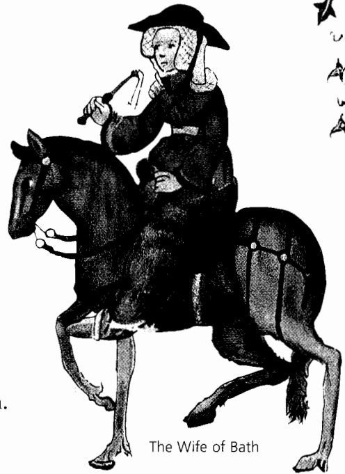
The Wife of Bath

“Madam, I put it to you as a prayer,” The Pardoner said, “go on as you began! Tell us your tale, spare not for any man. 25 Instruct us younger men in your technique.” “Gladly,” she said, “if you will let me speak, But still I hope the company won’t reprove me Though I should speak as fantasy may move me, And please don’t be offended at my views; 30 They’re really only offered to amuse. . . .”